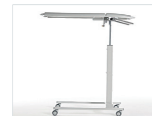
Design and quality made by GREINER