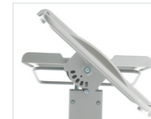
Swivelling tray (BT plus)