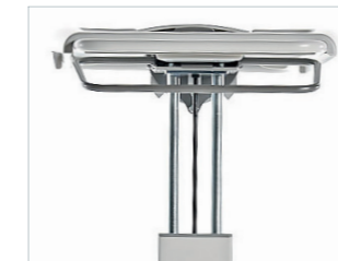
Height adjustment with dual control

Perfect for combining with the MULTILINE NEXT DC and IT (IT shown here)